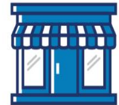
Small business (You)